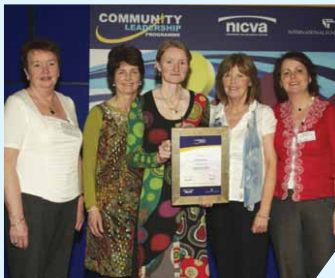
Representatives from Killybegs Women's Group are pictured being presented with their Community Leadership Programme certificate at the Programme's final workshop for year one.

The Programme has also given a number of those involved the confidence to take up leadership roles within their communities and one participant in the Programme has used her accreditation from the Institute of Leadership and Management (ILM) and the University of Ulster to move into employment.